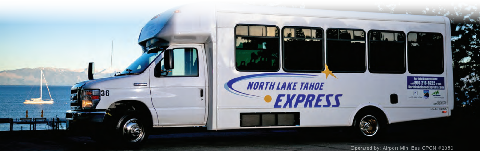
Operated by: Airport Mini Bus CPCN #2350